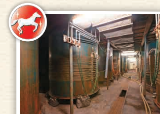
H3-7 Tokun Sake Brewery

☎ Sawara 1505, Katori ☎ 0478-52-4128 🗓 11:00-16:00 📄 Wed. (variations by season) 📄 Available