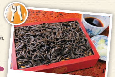
H3-6 Koboriya Honten

☎ 460 Sawara, Katori ☎ 0120-52-3571 🗓 8:00-19:00 📄 Open year-round 📄 Available