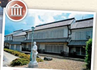
H3-2 Ino Tadataka Museum

☎ 1679 Katori, Katori ☎ 0478-57-3211 ☎ 8:30-17:00 🗓 Open year-round 🆓 Free 📄 Available