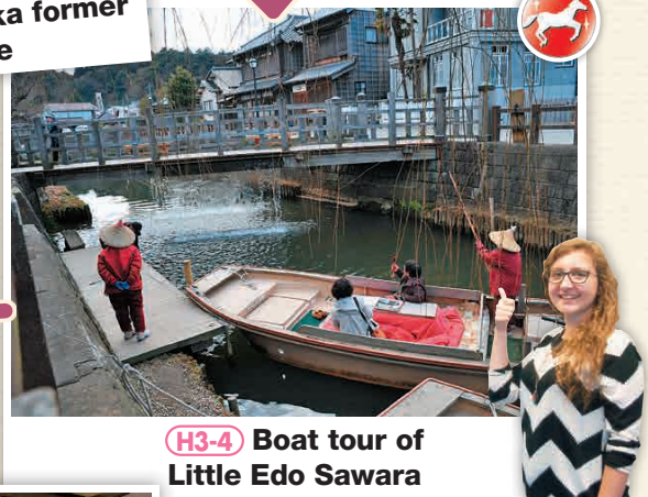
H3-4 Boat tour of Little Edo Sawara

☎ 1900-1 Sawara, Katori ☎ 0478-54-1118 🗓 9:00-16:30 📄 Open year-round 🆓 Free