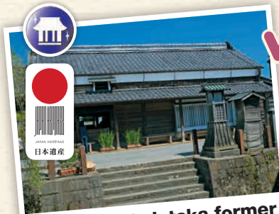
H3-3 Ino Tadataka former residence

☎ 1722-1 Sawara, Katori ☎ 0478-54-1118 🗓 9:00-16:30 📄 Mon. (open if public holiday) 🎫 500 yen 📄 Available