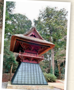
H5-1 Hanko-ji Temple

〒1789 Iidaka, Sosa ☎0479-73-0089 (Industrial Promotion Division, Sosa City Office) ♻️Free access to grounds ♻️Open year-round ♻️Free