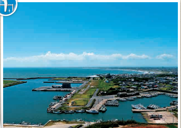
H5-2 Iioka Gyobu-misaki (Gyobu Cape) Observatory - Light and Wind