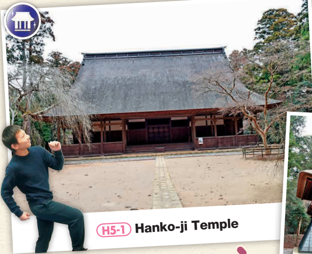
H5-1 Hanko-ji Temple

As there are steep steps to Hanko-ji Temple on the road from the bus stop, wear comfortable walking shoes. As you will use taxi, it is recommended to go in groups of over 3 persons. Wash away the sweat in the hot springs at the end of the trip.