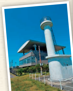
H5-2 Iioka Gyobu-misaki (Gyobu Cape) Observatory - Light and Wind

An observatory on an approximately 60m high cliff facing the Pacific Ocean. View the sun rising up from and sinking into the ocean.