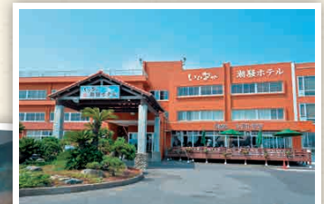
H5-3 Iioka Shiosai Hotel

There is a natural hot spring highly-rated for the healing properties of its dark brown spring. There is also a popular bathing beach nearby.