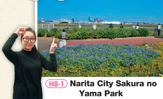
H8-1 Narita City Sakura no Yama Park

There are around 300 cherry blossom trees and many cherry blossom viewers gather during their flowering season. Also a good location to view take-off and landing of aircraft.