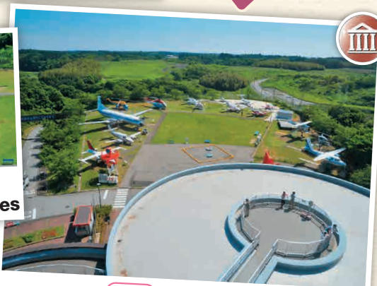
H8-2 Museum of Aeronautical Sciences

111-3 Iwayama, Shibayama-machi, Sanbu-gun 0479-78-0557 10:00-17:00 (Final admission 16:30) Mon. (holiday in lieu on day after if public holiday), no holidays in August 500 yen Available