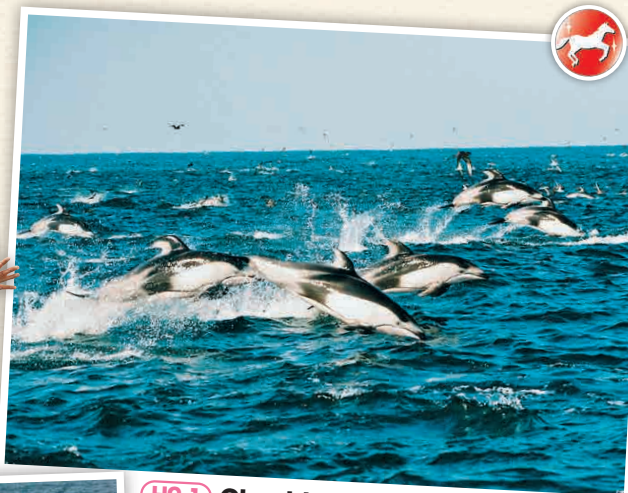
H9-1 Choshi Ocean Institute dolphin watching

Large shoals of up to 5000 dolphins can at times appear offshore of Choshi. There is a dolphin/whale watching cruise year-round.