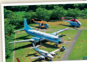
H8-2 Museum of Aeronautical Sciences

1338-1 Komaino, Narita 0476-33-3309 6:00-23:00 (Soranoeki Sakurakan marketplace 9:00-18:00) Open year-round Available