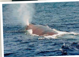
H9-1 Choshi Ocean Institute dolphin watching

15-9 Shiomi-cho, Choshi 0479-24-8870 8:00-19:00 Irregular holidays From 3,500 yen Available