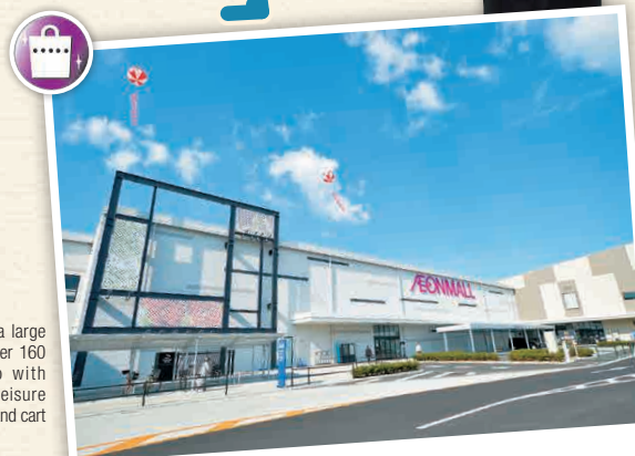
K10-3 Aeon Mall Kisarazu

A mall with a line-up of a large scale supermarket and over 160 specialty shops. Also with extensive selection of leisure activities including cinema and cart racing circuit.