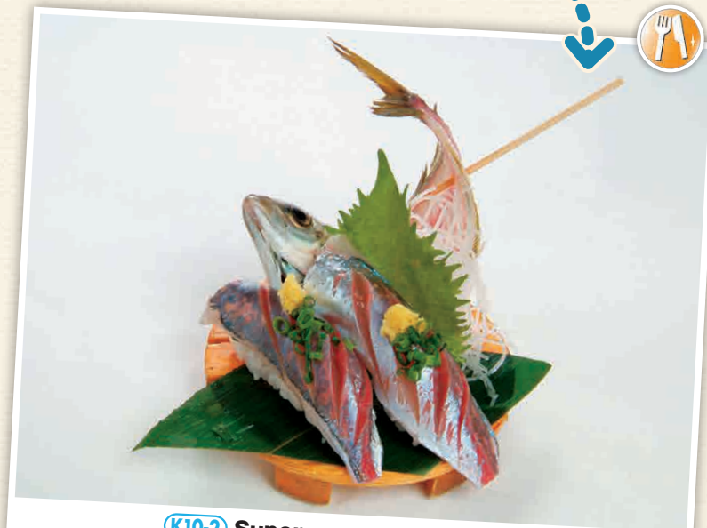
K10-2 Super conveyor belt sushi "Yamato" Kisarazu branch.

Conveyor belt sushi restaurant directly operated by a seafood company which continuously prides itself on wild tuna and the location direct from the fishing grounds. Over 100 menu varieties on offer.