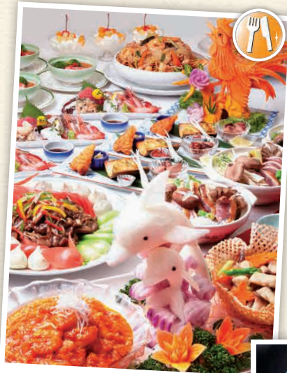
K3-2 Hotel Sennari

A long standing hotel with a restaurant with popular authentic Chinese (Cantonese) and Japanese cuisine which makes use of the ocean's bounties.