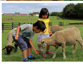
K3-1 Mother Farm

A tourist farm with many attractions, such as activities including a sheep show, baby pig race, petting zoo.