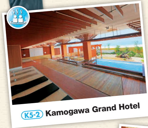
K5-2 Kamogawa Grand Hotel

The views of the Pacific Ocean are magnificent, from the large hot spring bath where you can see the sea, and from guest rooms. Incorporates day spa and restaurant facilities.