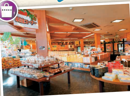
K5-4 Shunsai, Shiosai market

Souvenir shop boasting its foremost expertise in the surrounding area. The selection of special produce from Minamiboso is particularly comprehensive.