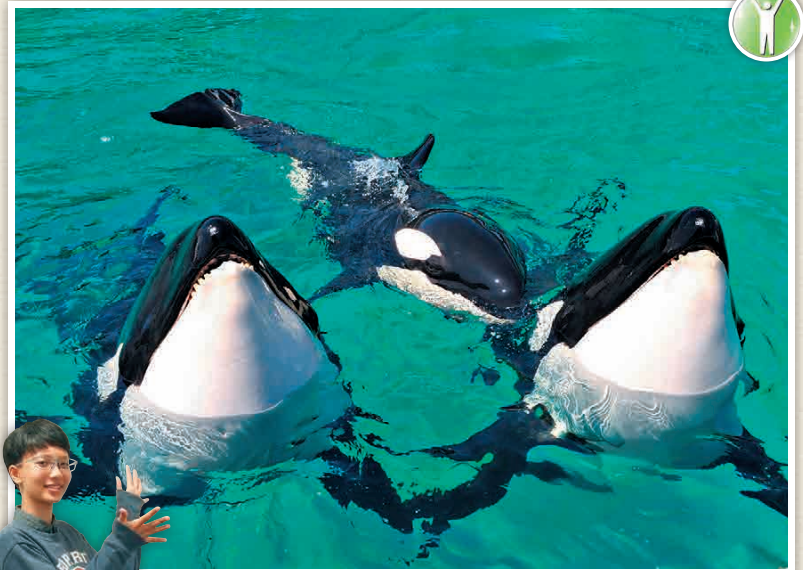
K5-1 Kamogawa Sea World

Access is good from Tokyo or Kaihin-Makuhari to Awa-Kamogawa. While slightly difficult to access from Narita International Airport, there are various ways to get there depending on the time of day, so please confirm. Noteworthy spots are concentrated around Awa-kamogawa so you can easily sightsee on foot.