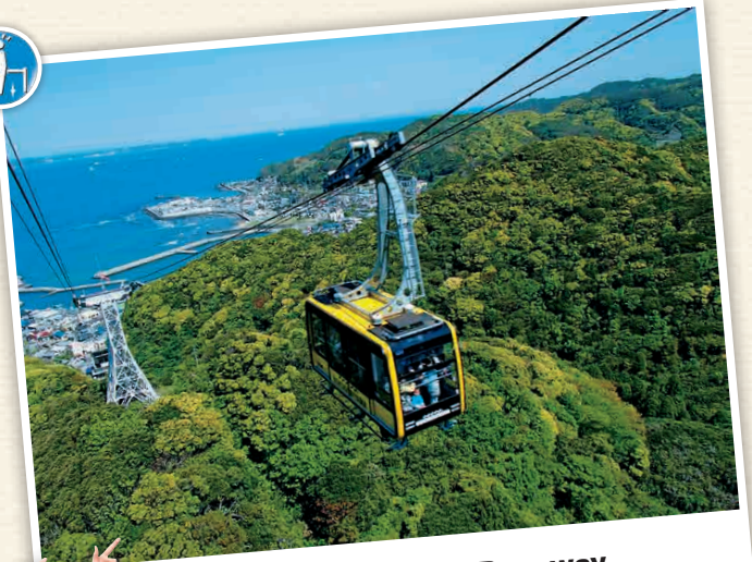
K6-1-3 Mt. Nokogiri Ropeway

An aerial cableway (ropeway) which climbs to a 330m elevation at the peak of Mt. Nokogiri. There is a 360 degree panorama from the peak observatory.