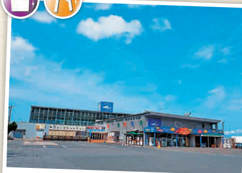
K6-5 The Fish

Seafood restaurant and marketplace. Enjoy shopping and meals while looking out over the scenery of Uchibo at a sea-facing location.