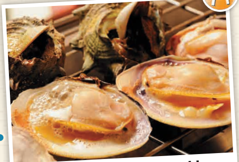
K6-4 Kaisen-Hamayaki Maruhama seafood

A restaurant where you can eat fresh fish and shellfish, barbecue style. 90mins all-you-can-eat.