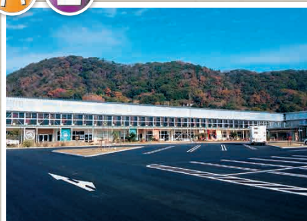
K7-3 Road Station Hota Elementary School

An integrated facility using a disused elementary school. Includes shops and restaurants selling regional products.