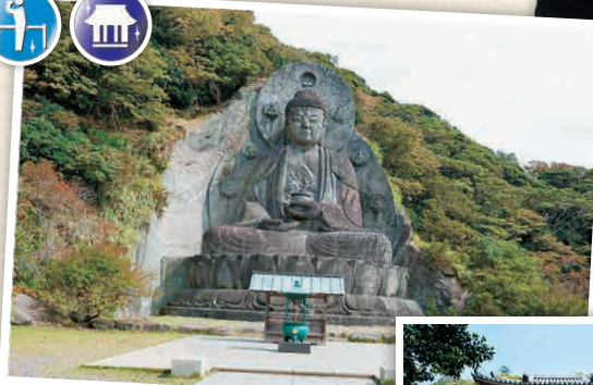
K7-2 Mt. Nokogiri/Nihon-ji Temple

The origin of the name is the saw-like serrations in the mountain range profile. The great buddha and kannon statues carved into the rockface in the grounds of Nihon-ji Temple on the peak are a must-see.