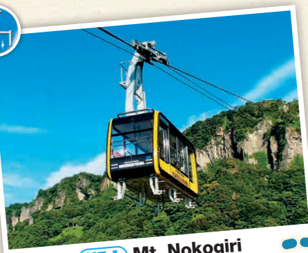
K7-1 Mt. Nokogiri Ropeway

An aerial cableway (ropeway) which climbs to a 330m elevation at the peak of Mt. Nokogiri. There is a 360 degree panorama from the peak observatory.