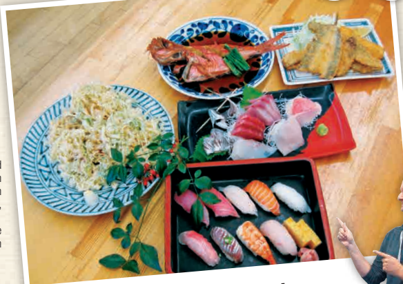
K7-4 Banya dining

The fish caught in fixed nets offshore each morning, can be eaten as, for example, sushi, sashimi or tempura. Get a real feel for the deliciousness of fresh fish.