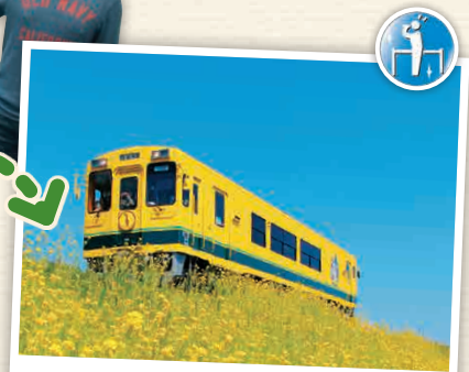
NI-2 Isumi Railway

☎0436-23-5584 📍Goi Station - Yoro-Keikoku Station, 11 return journeys Sat, Sun, and public holidays (3 return journeys are "Trolley trains"), 5 return journeys to Kazusa-Nakano Station 📄Boarding ticket 500 yen + Train fare. One-day train pass 1800 yen 📄Available