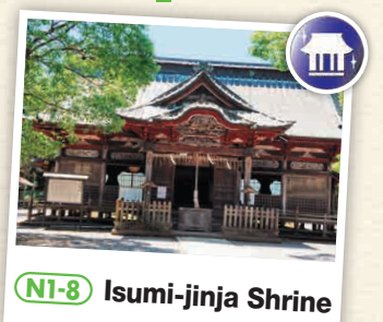
NI-8 Isumi-jinja Shrine

☎83 Shinmachi, Otaki-machi, Isumi-gun ☎0470-82-5656 📄9:00-17:30 📄Wed.