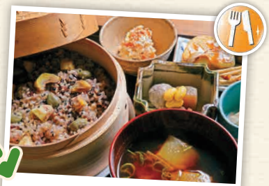
NI-6 Kurasho restaurant

☎153-1 Kubo, Otaki-machi, Isumi-gun ☎0470-80-1146 📄9:00-17:00 (to 16:00 Nov.-Feb.) 📄Open year-round 📄Free