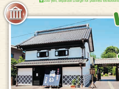
NI-5 Akinai Trading Archive

☎126 Kubo, Otaki-machi, Isumi-gun ☎0470-80-1146 📄Freely tour site (outside only) 📄Open year-round 📄Free