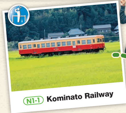
NI-1 Kominato Railway

A journey which begins from Uchibo's Goi. While there are frequent trains operated to Goi, there are not many local lines from there, so you should carefully confirm the timetable in advance. Generally moving about is on foot so wear comfortable shoes.