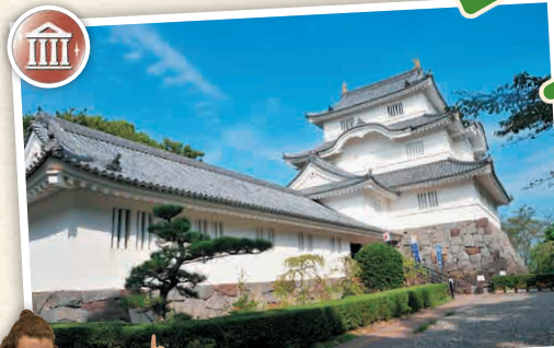
NI-3 Otaki Castle Branch, Natural History Museum and Institute, Chiba

☎0470-82-2161 📄Approx. 15 return journeys operated on weekdays. Around one train per hour during daytime. 📄One-day train pass 1000 yen 📄Available