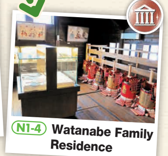
NI-4 Watanabe Family Residence

☎481 Otaki, Otaki-machi, Isumi-gun ☎0470-82-3007 📄9:00-16:30 (Last admission 16:00) 📄Mon., if holiday, closed on day after 📄200 yen, separate charge for planned exhibitions 📄Available