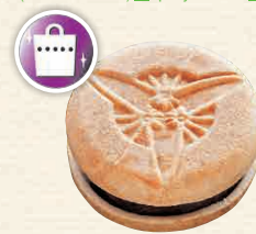
NI-7 Tsuchiya, Shinmachi Store

Known for its excellent local confections "Monaka-jumanguku." Monaka is sweets consisting of adzuki beans wrapped in glutinous mochi rice skin.