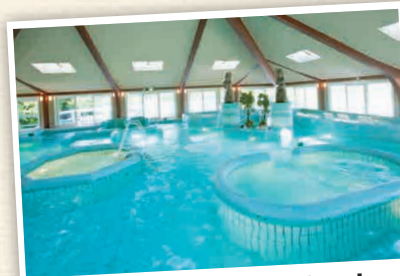
N4-1 Thermes Marins du Pacifique

☎ 1920 Okitsu, Katsura ☎ 0120-655-779 ☎ 9:00-21:00 (Aquatic till 20:30) 📅 Irregular holidays 📅 Aquatic 4,320 yen (2,160 yen after 17:30. Weekday pricing) 📄 Available