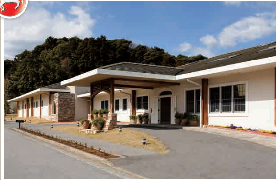
N4-1 Thermes Marins du Pacifique

A spa with various "Thalassotherapy" programs using seawater available. Package plans including use of the accommodation facilities in the surrounding area are also available.