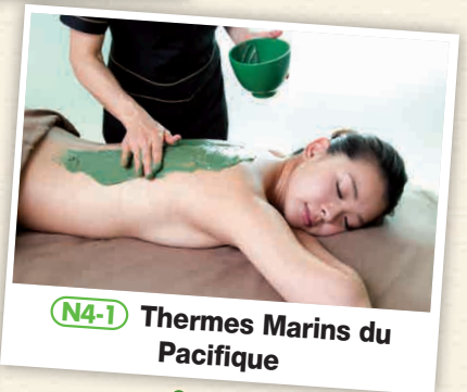
N4-1 Thermes Marins du Pacifique