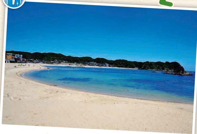
N4-2 Moriya Bathing Beach

The highly-transparent seas have been selected among the "Top 100 Bathing Beaches in Japan" The red Torii archways standing offshore create a uniquely Japanese scene.