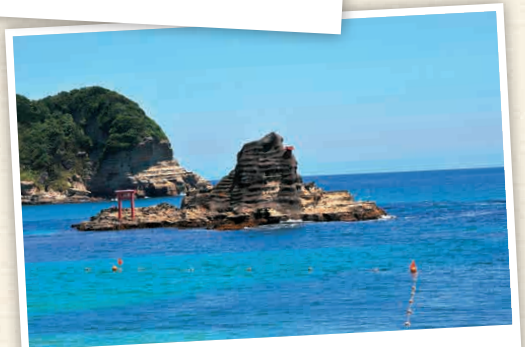
N4-2 Moriya Bathing Beach

☎ Moriya, Katsura ☎ 0470-73-6641 📅 Swimming season mid July - late August