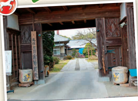
N5-2 Kankiku-Meijyo brewers

A brewery where both sake and local beer are produced. Tours of warehouse possible, and "shikomi", the preparation stage of sake mash, can be observed from November to March.