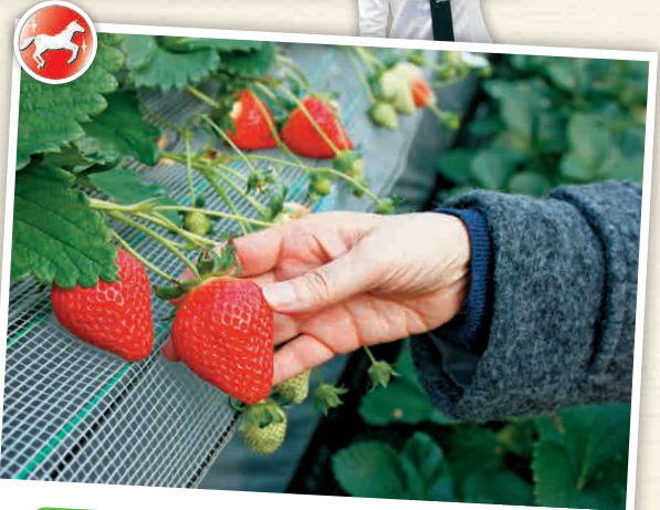
N5-1 "Ichigo-gari," Strawberry Picking

〒305 Tsube, Sammu, In front of JR Naruto Station (Station Tourist Information Office) ☎0475-82-2071 ☑Mid-December to mid-May 40mins between 10:00-15:00 (gardens close when ripe strawberries run out) ☒Irregular holidays ☎1100-2000 yen (variations by season) ☑Available