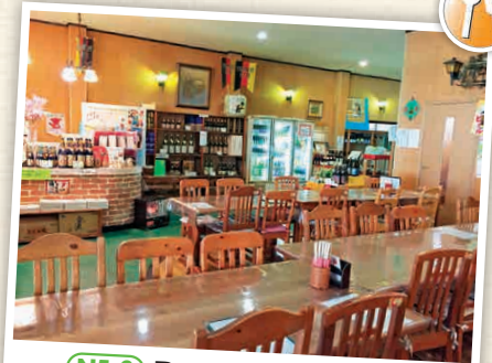
N5-3 Beer restaurant in Kankiku-Meijyo brewery

Restaurant run directly by Kankiku-Meijyo brewery. A popular menu item is the tasting sets which allow you to compare, for example, different sakes or local beers.