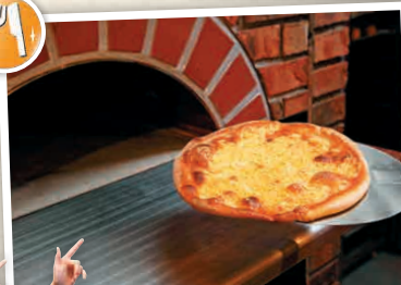
N8-2 Seimei no Mori Restaurant Boulogne