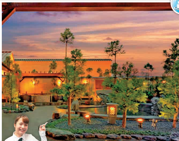
T1-2 Gensen-Nanakodai Onsen

A hot bath facility with various styles of baths. Also with health-benefitting facilities such as a medicinal herb sauna. Meals are also available.