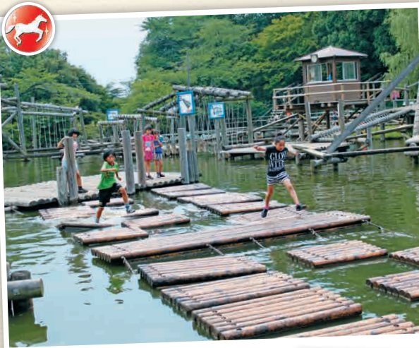
T1-1 Shimizu Park

Please wear sneakers if you are going to enjoy the ropes adventure course in the park. After you have had your fill of activities, enjoy the hot spring experience in a super public bath. Relax at the relaxation space where you can also dine.