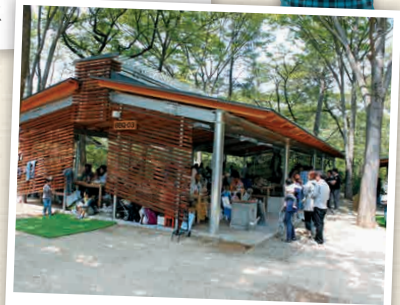
T1-1 Shimizu Park