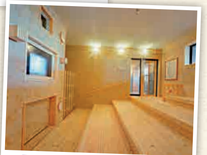
T1-2 Gensen-Nanakodai Onsen