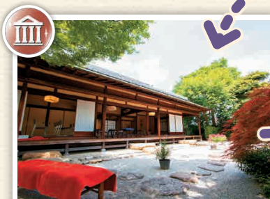
T3-2 Sengen-jinja Shrine

This is a location where Isami Knodo, a key figure in the Tokugawa shogunate's armed force during the Boshin War in the closing days of the Tokugawa government, stopped to regroup for battle during a flight. 〒2-108 Nagareyama, Nagareyama ☎04-7168-1047 🆓Freely tour site