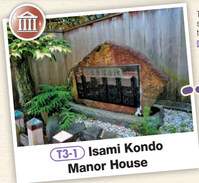
T3-1 Isami Kondo Manor House

Nagareyama, which flourished as a central location for trade from the Edo period through the Taisei and Showa eras. Walk the town retaining relics and traces from the era. There is a concentration of noteworthy spots so you can easily sightsee on foot.