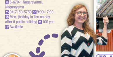
T3-4 Kaleidoscope Gallery Misegura, Terada-en Tea Store

The old estate and gardens which are relics of the city are a merchant house of an acquaintance of Issa Kobayashi, a prominent poet of the Edo period who visited it many times. 〒6-670-1 Nagareyama, Nagareyama ☎04-7150-5750 🆓9:00-17:00 🆓Mon. (holiday in lieu on day after if public holiday) 🆓100 yen 🆓Available