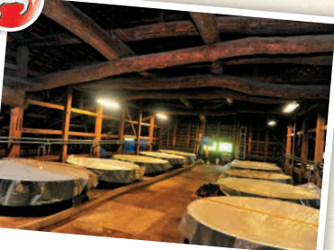
T3-6 Kubota sake brewery

A park along the banks of the Tone Canal. You can enjoy nature's seasonal changes through walks including cherry blossoms in spring and red spider lilies in autumn. 〒368-1 Higashi Iukai, Nagareyama ☎04-7150-6092 🆓Freely access park 🆓Open year-round 🆓Free