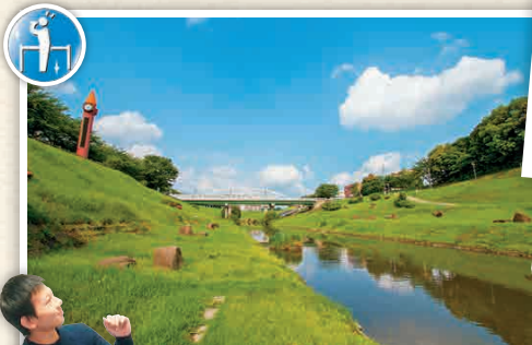
T3-7 Unga Mizube Park (Canal Waterside Park)

An Italian restaurant in an old building erected in 1923. Specialties include kiln-fired pizza and pasta. Originally a split-toed tabi sock shop. 〒Nagareyama 1-5, Nagareyama ☎04-7192-7953 🆓11:00-14:30, 18:00-20:30 (evening reservation system) 🆓Mon. 🆓Available