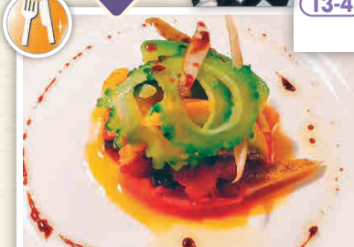
T3-5 Chojiya-Sakae, Italian

A gallery of rare kaleidoscopes. A merchant's house built in 1889 and nationally designated as a building of historical importance. 〒2-101-1 Nagareyama, Nagareyama ☎04-7190-5100 🆓10:00-17:00 🆓Mon./Tue. 🆓Available