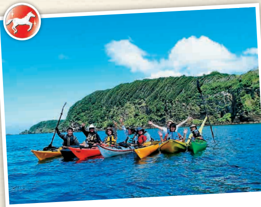
K8-1 Paddle Sports Ru-

The highway bus "Boso Nanohana" is reserved seats only, so reservations are required (HP: kousokubus.net). There are not many buses which stop at Familio Tatemaya-mae bus stop if using the Highway Bus from Tokyo Sta. Rental bikes are available at the Tourism and Town planning center at Tatemaya Sta. (west exit) for 500 yen (2hrs). ID cards are required.