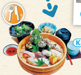
K8-3 Hana Sohonten

A restaurant which has continuously provided local cuisine using ingredients from Minamiboso for nearly half a century. Fish dishes using fresh produce are recommended.