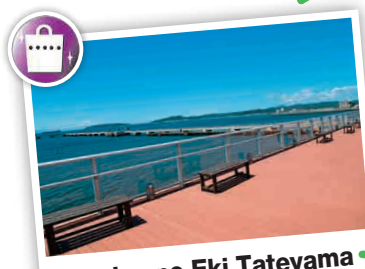
Nagisa no Eki Tatemaya

Direct sales of local fresh vegetables and fish and shellfish, souvenirs, and so on. There is also a facility where creatures from Tatemaya Bay are displayed.