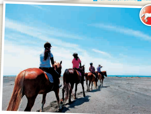
K8-2 Horse Trekking Park Tatemaya